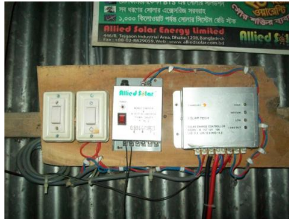
10Kw Solar Power System Installed at Doreen Tower, Gulshan