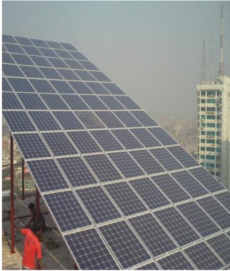
Solar System Installed at WW Tower, Motijheel